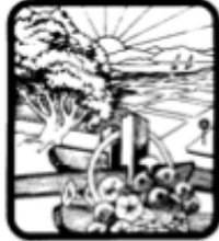
Santa Clarita Organization of Planning and the Environment (SCOPE)